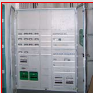
Main distribution frame in an old people's home

MACHINE CONTROL, POWER SUPPLY, AUTOMATION SYSTEMS, DRIVE, MEASUREMENT AND CONTROL TECHNOLOGY