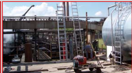
Control of a water treatment plant with caustic soda at Thyssen-Krupp in Andernach, Germany.