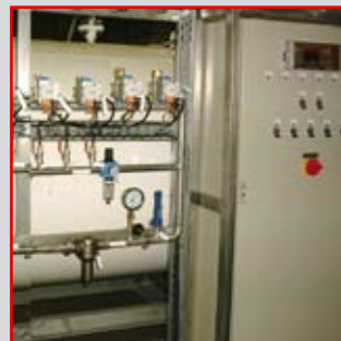
Control of an inertisation plant for a coal-grinding plant in Peru