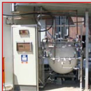
Inert gas unit with integrated CO measurement